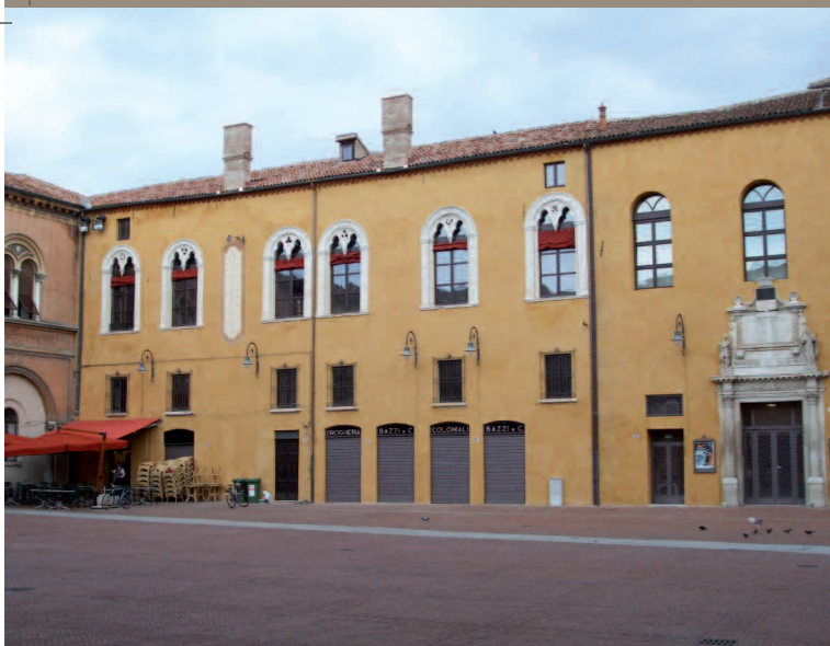
The Municipal Square, the façade with the monumental portal of the Estense Hall, the trefoil windows of the main floor and the Sundial, dated from 1869.