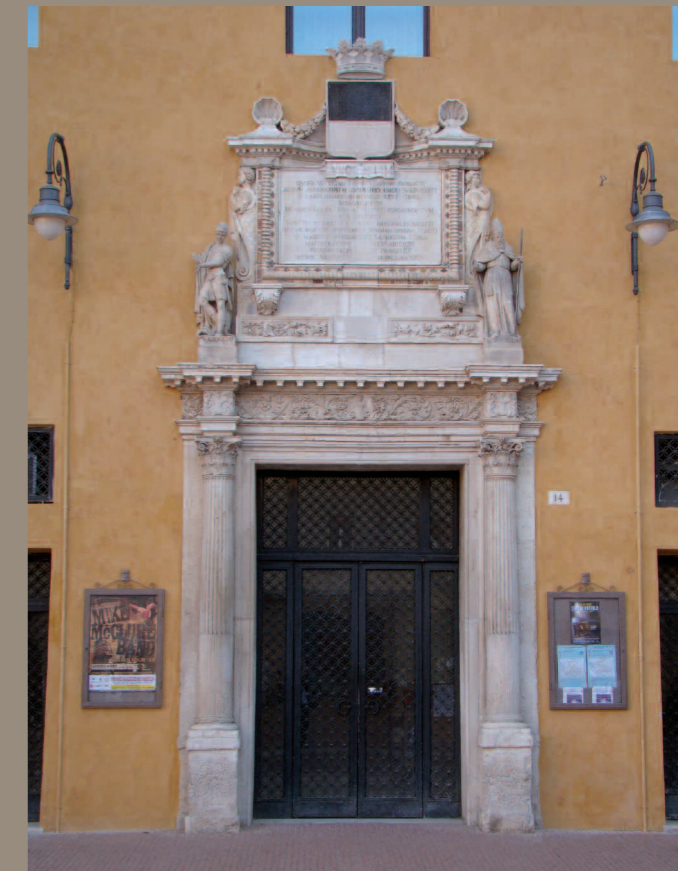
The Estense Hall