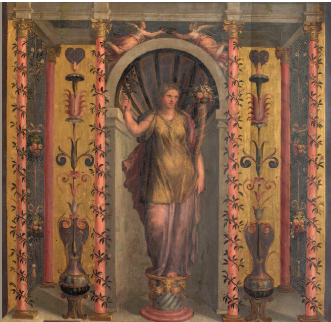
The Duchesses' Camerino, The Abundance Allegory (detail)

The façade along Corso Martiri della Libertà is the result of a restoration operated in 1738 by the architects Angelo and Francesco Santini. On Piazza Savonarola the palace is characterised by the so-called Loggia dei Camerini, elegant XVI Century architectural structure in marble on six arcades. The upper part has been built during the XVIII Century works directed by the Santini brothers.